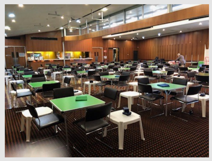
The Stables Ballroom, the main playing area

As one of the organising team who have been working since 2019 to provide an enjoyable bridge experience for you, we are glad to finally be able to welcome you to the 2022 Adelaide ANC.