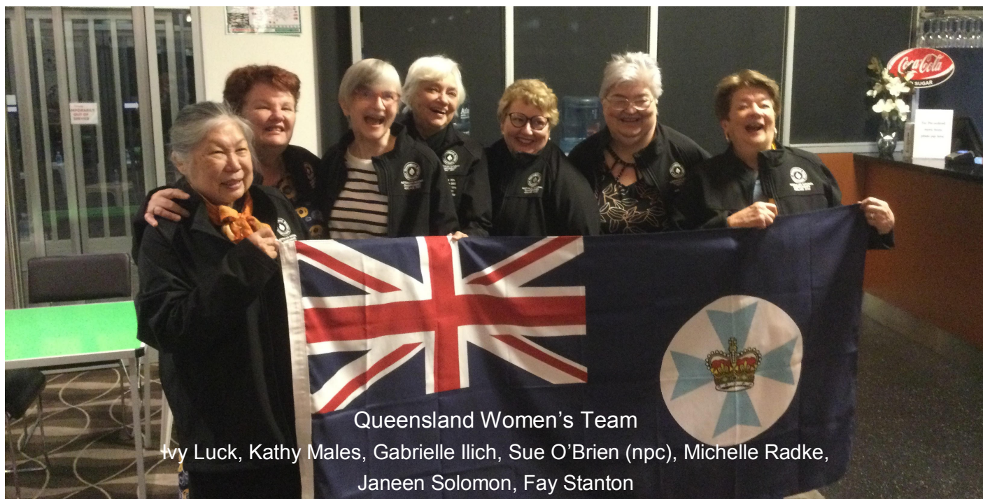
Queensland Women's Team

As usual the original is far better. But it's a fun exercise - perhaps all the teams should try it!