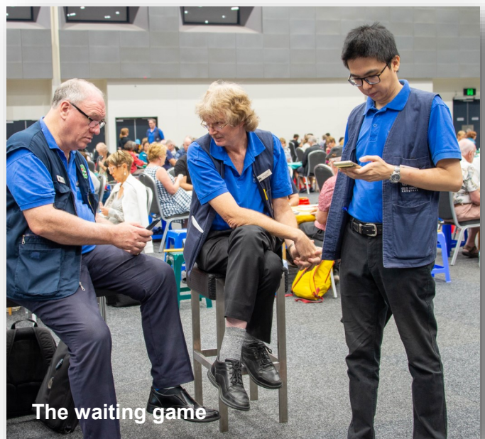
The waiting game