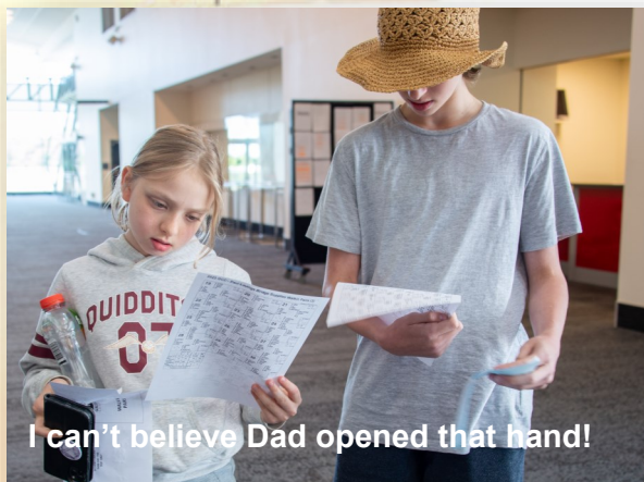
I can't believe Dad opened that hand!