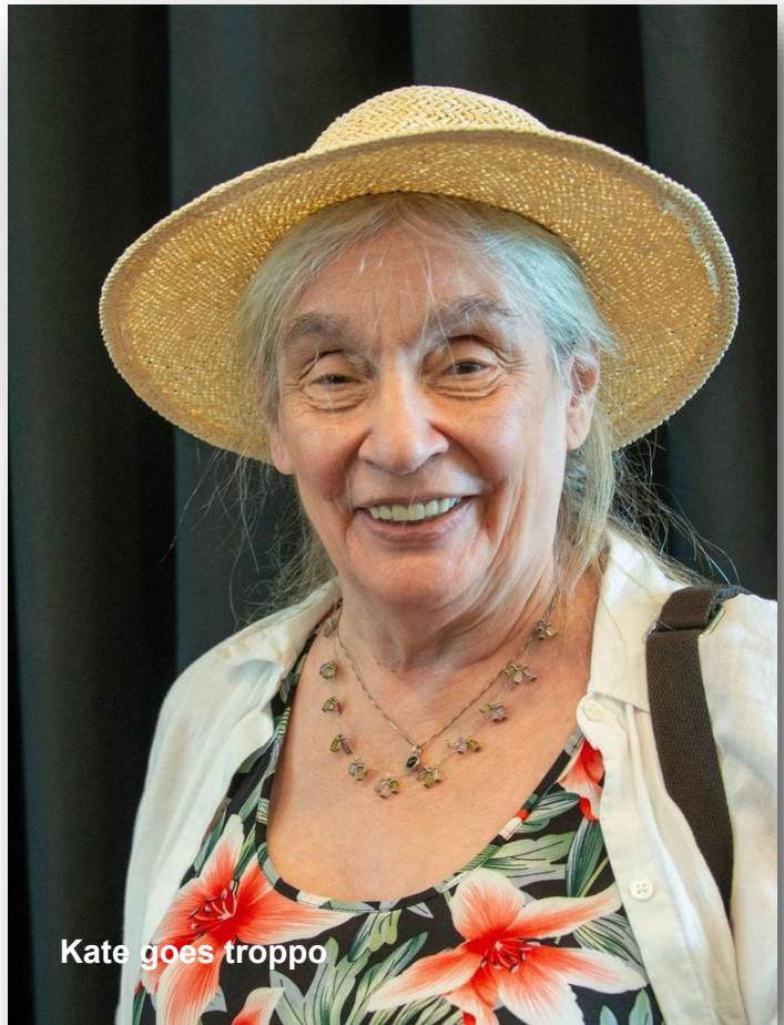
Kate goes troppo

Please contact Suzie via 0411 229 705 or suzie@ronklingerbridge.com for email.