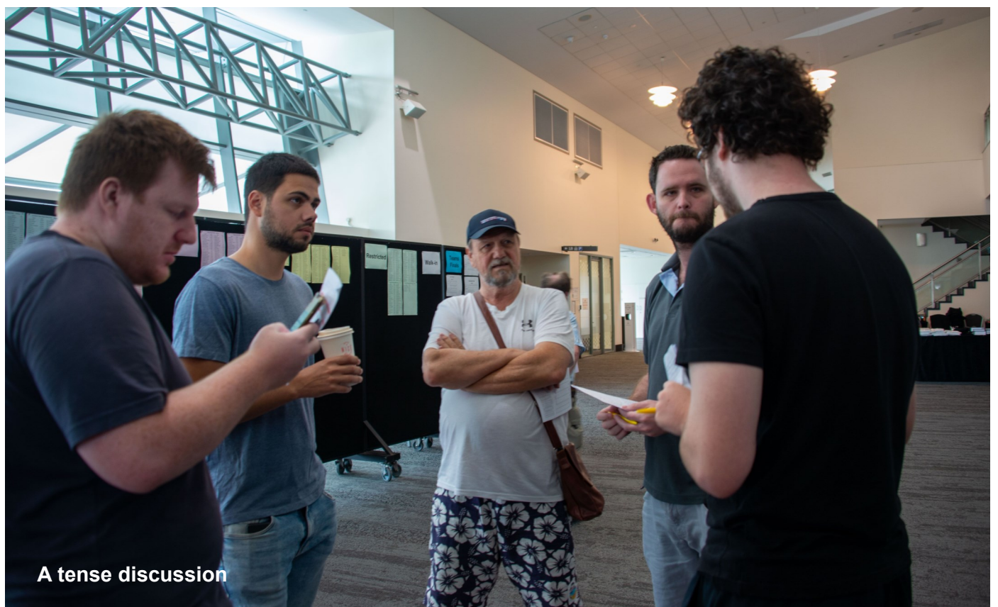
A tense discussion