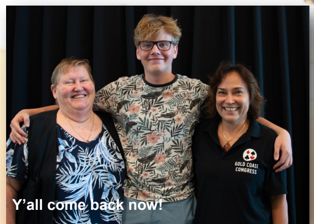
Y'all come back now!

In 2024 the Gold Coast Congress will be held from the 17th to 24th February, with the theme Sports