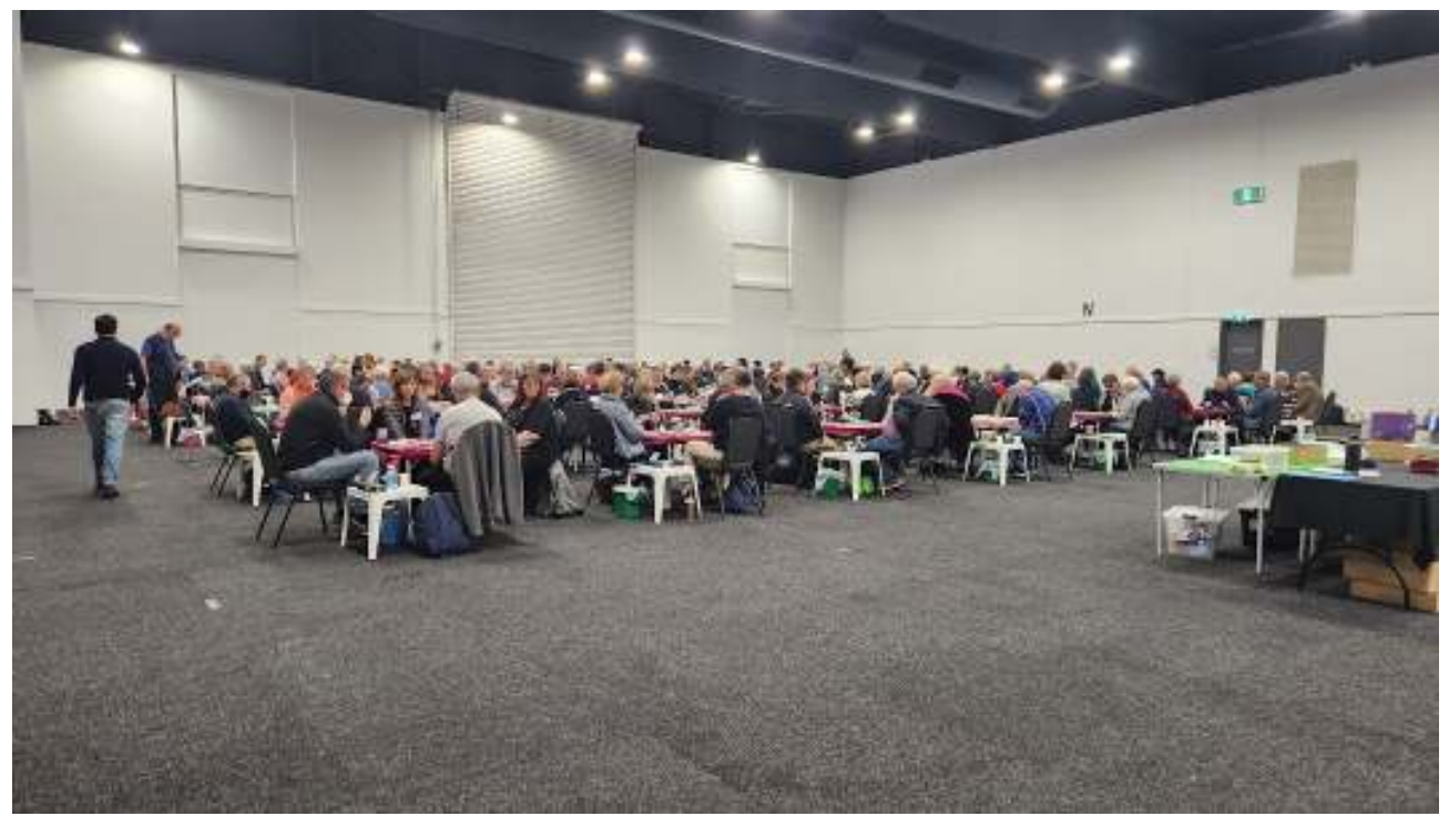
A view of the venue (Ridley Centre) looking towards the Open Pairs event.