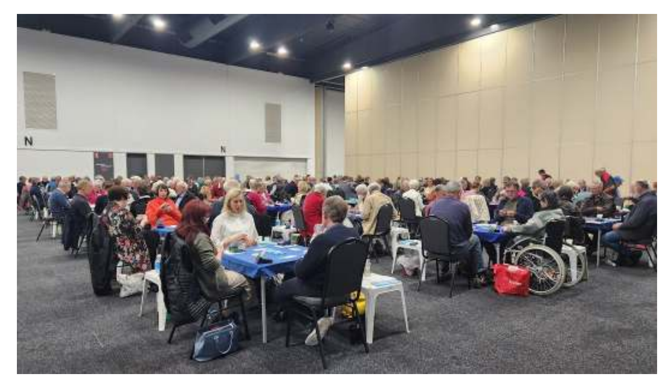
The various 'restricted' Pairs events in play – Under Grand, Under Life and Rookie.