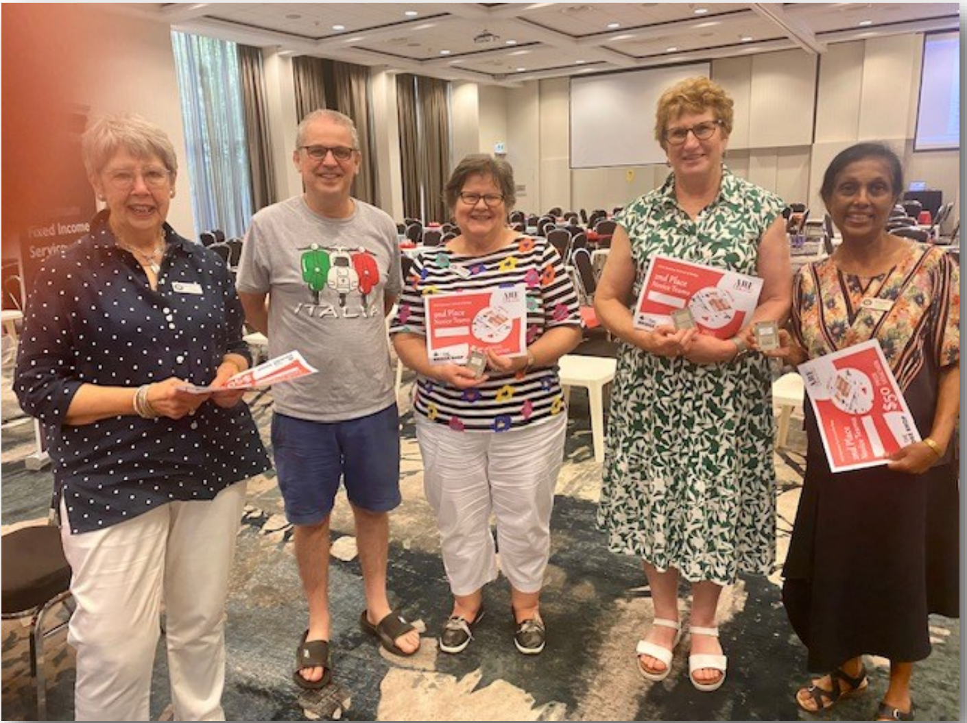
THEARLE, 2nd The Bridge Shop One Day Novice Teams