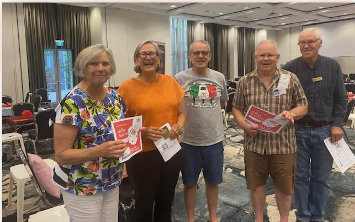
KLOREN, 1st The Bridge Shop One Day Novice Teams