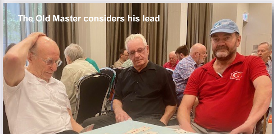
The Old Master considers his lead

One player plays Gerber (a pet love) and the other plays CRO Gerber (Colour Rank Odd)! Modern.