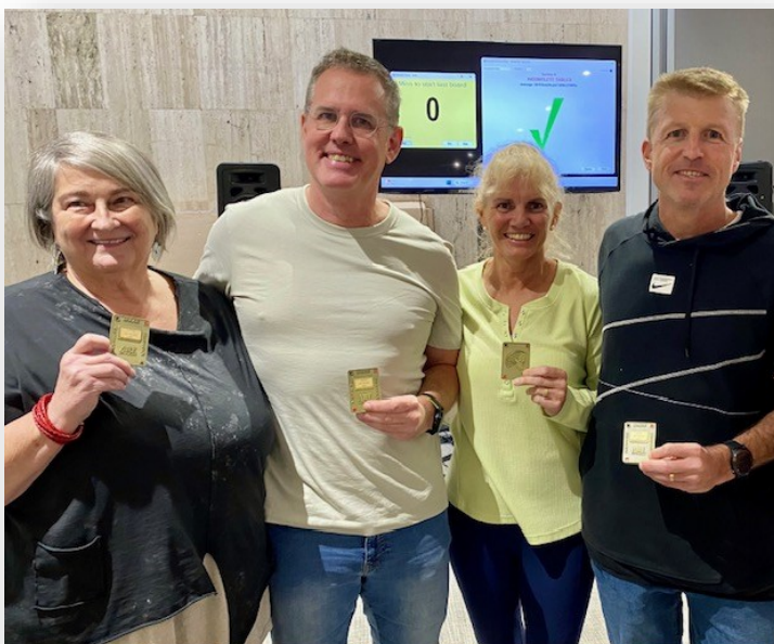
PALFREYAN, winners <750 Swiss Teams