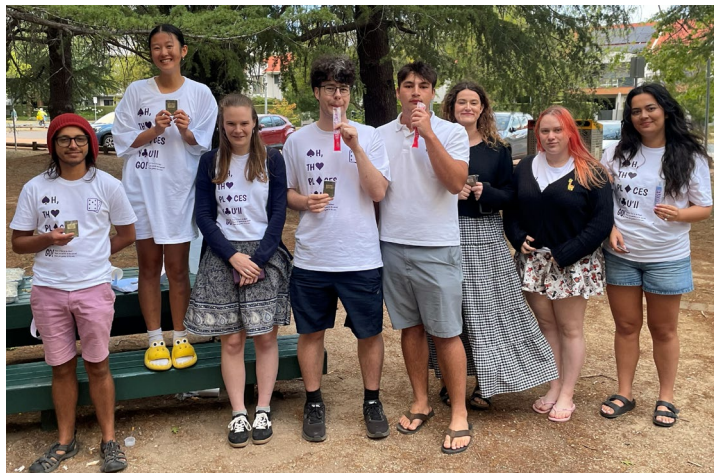
Trans-Tasman winners: Team New Zealand