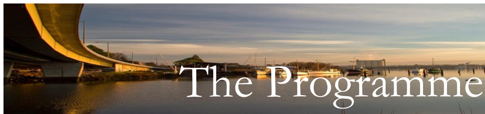
The Tamar River, Launceston

Venue for all events: Hotel Grand Chancellor, 29 Cameron Street, Launceston