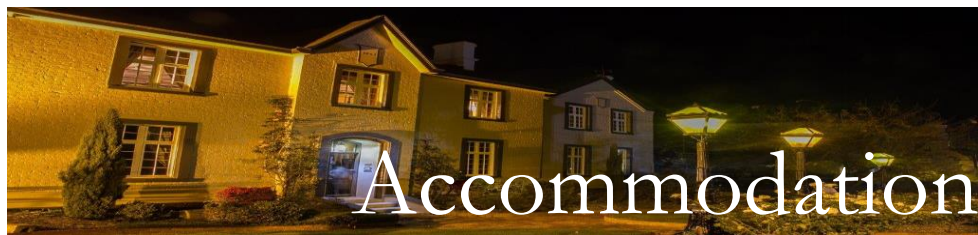
Colonial Motor Inn, Launceston

Please book early as Launceston can become very busy in March.