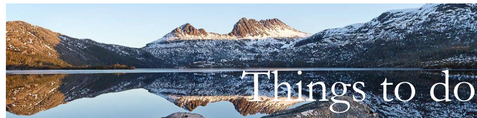
Cradle Mountain