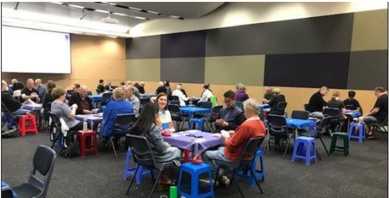
OPEN & MIXED BUTLERS FINALS