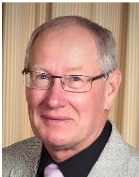
John McKenzie Transport and Accommodation